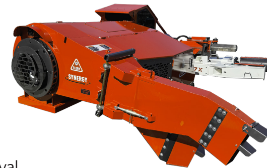
SYNERGY BLOWER OPTION